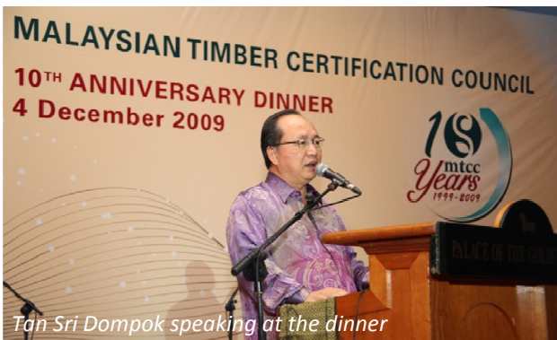
Tan Sri Dompok speaking at the dinner

its operation. I am happy to note that currently 4.43 million hectares or 33% of the permanent reserved forests in Malaysia are certified under the MTCS. Having become the first certification scheme in the Asia Pacific region to be endorsed under the Programme for the Endorsement of Forest