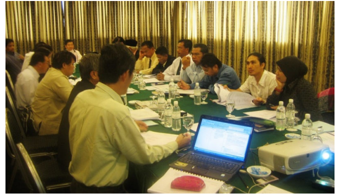
SRC Meetings in Kuala Lumpur (left) and Kota Kinabalu (right)