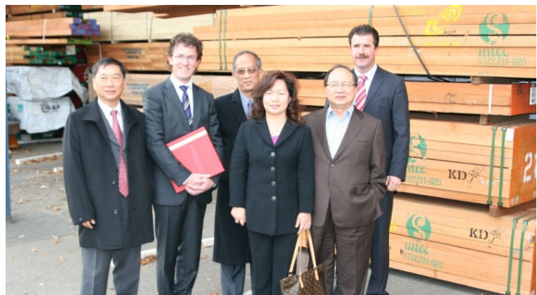
YB Minister and Delegates viewing MTCS-certified timber at Van de Vin Window and Window Frames in Heeze, The Netherlands