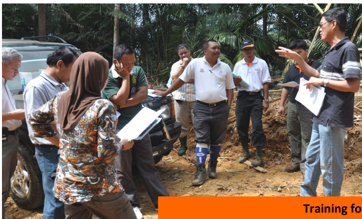
Training for new auditors