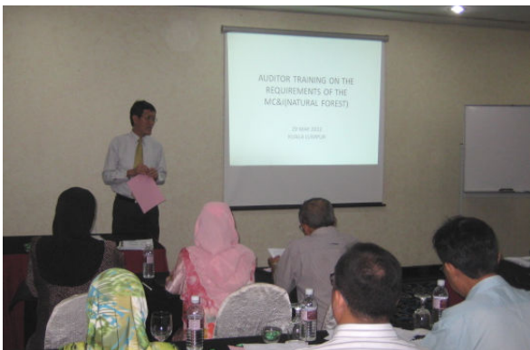
Training for existing trained auditors

A one-day Auditor Training Course was conducted on 29 May 2012 for the existing trained auditors of the MTCS-notified Certification Bodies (CBs). The main purpose of the training course was to inform the auditors on the transition plan for the implementation of the MC&I(Natural Forest), and to familiarise them with the requirements of the MC&I(Natural Forest) by highlighting the differences in the requirements between the MC&I(2002) and the MC&I(Natural Forest) at the Principle, Criteria, Indicator and Verifier levels. A total of 19 auditors from SIRIM QAS International Sdn. Bhd, SGS (Malaysia) Sdn. Bhd. and STANDARDS MALAYSIA attended the training course.