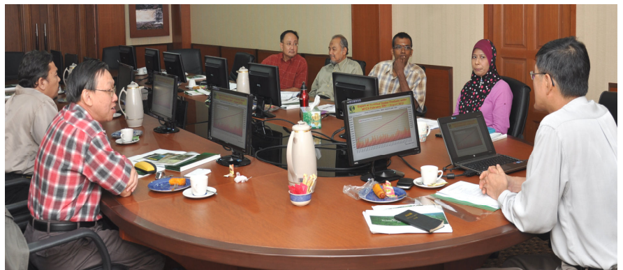
Training for peer reviewers