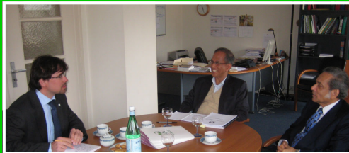
Discussion with PEFC Secretariat

Following the submission, in conjunction with the MTCC-Hamburg Workshop in Hamburg on 16 April 2008, MTCC held a follow-up discussion with the PEFC in Luxembourg on 14 April 2008. The discussion with the PEFC provided greater clarity and guidance regarding the documentation required under the PEFC endorsement process. For further information regarding the MTCC submission for endorsement of the PEFC Council, please contact MTCC.