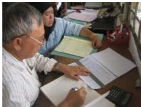
Auditor checking on details of Removal Pass with Tree Tagging record during assessment of Kelantan FMU