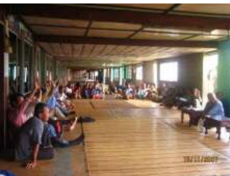
Auditor conducting consultation with Iban Community during assessment of Anap Muput FMU