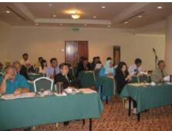
MTCC-Hamburg Joint Project Regional Workshops in Sarawak (top), Sabah (middle) and Peninsular Malaysia (bottom)

The field test would involve a thorough evaluation of all Indicators and Verifiers contained in the draft standard, including their practicality and auditability, based on documentation review and site visits.