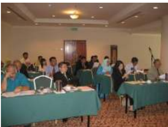
MTCC-Hamburg Joint Project Regional Workshops in Sarawak (top), Sabah (middle) and Peninsular Malaysia (bottom)