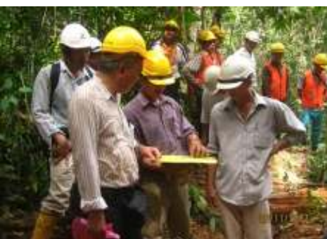
Auditor being briefed on alignment of skid trail during assessment of Anap Muput FMU