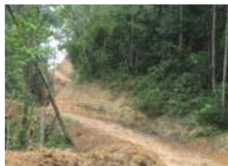
Well constructed forest road in Perak FMU