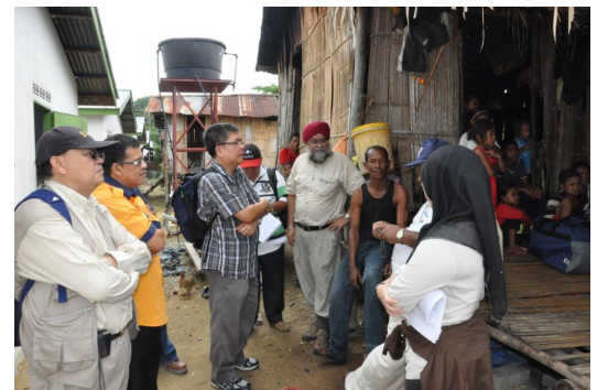
Visit and discussion at Orang Asli village