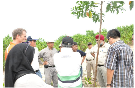
Visit and discussion at the R&D plot