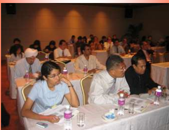
MTCC-Hamburg Joint Project Inception Workshop