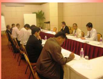
Second JPT Meeting