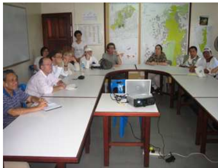
Briefing by Samling

The delegation was briefed by Samling Plywood (Baramas) Sdn. Bhd. on the forest management activities in the FMU. The delegation also held discussion with representatives of the indigenous communities, as well as visited the community coffee planting project.