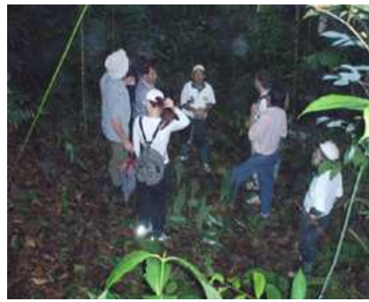
Visit to closed skid trail