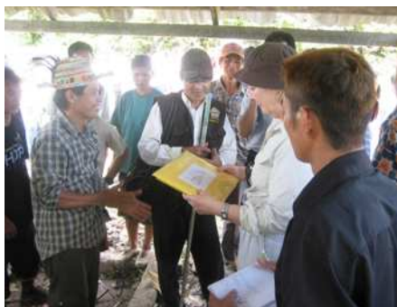
Meeting the indigenous communities