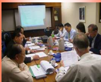
Third Meeting of the TWG