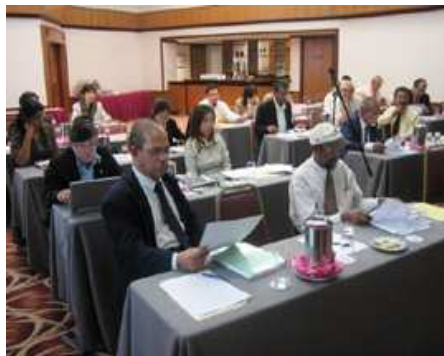
Regional Consultation on MC&I(Forest Plantations) in Peninsular Malaysia